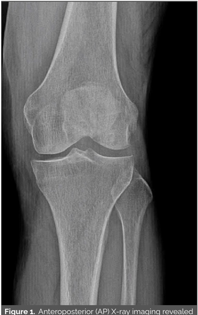
Figure 1. Anteroposterior (AP) X-ray imaging revealed no findings suggestive of fracture

The patient had type 2 diabetes mellitus (DM) and was taking oral antidiabetic and insulin for 6 years as well as Lthyroxine for 1 year due to hypothyroidism.