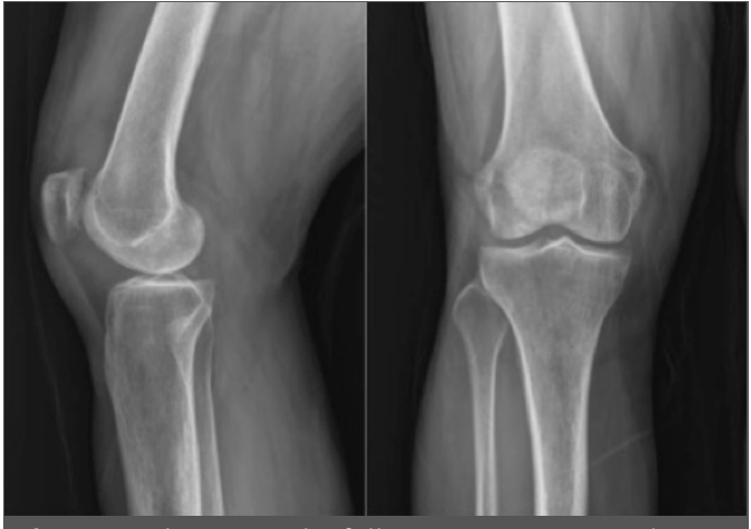
Figure 4 . Three months follow-up anteroposterior and lateral x-rays