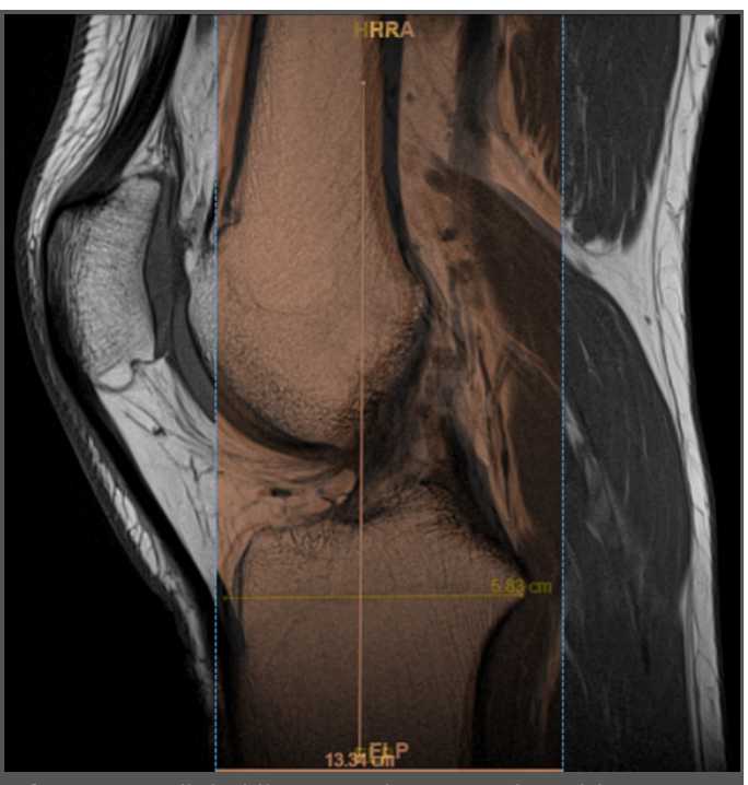
Figure 1. A digital line was drawn on the widest part of the tibial plateau; perpendicular to the tibial mechanical axis (black white background), and then a second scan showing ACL midpoint (red background) was superimposed digitally. The distance of the ACL midpoint in relation to the measured distance of the tibial plateau in an anterior-posterior direction was measured as a percentage as shown.

T2 weighted sagittal scans were analyzed by an independent researcher on GE Healthcare PACS viewer with an accuracy of 0.1 mm. The most anterior and the most posterior aspect of the tibial plateau was marked on separate scans according to the method of Staubli and Rausching (10). Then these scans were superimposed to capture the widest portion of tibial plateau perpendicular to mechanical axis of tibia. Next, perpendicular lines were dropped from the most anterior part and the most posterior part of ACL tibial footprint and then ACL midpoint was identified. The distance of ACL midpoint in relation to the measured distance of the tibial plateau in an anterior-posterior direction was measured as a percentage, so no magnitude correction was needed. (Figure 1) On separate scans, posterior border of the anterior horn of the lateral meniscus (LMAH), tip of medial (ME) and lateral eminences (LE) were identified and same measurement method was repeated for each parameter. (Figure 2)